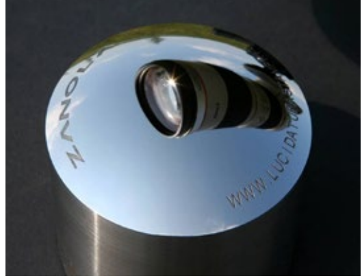
The cleanliness make it possible to do polishing and texturing to very high quality levels.