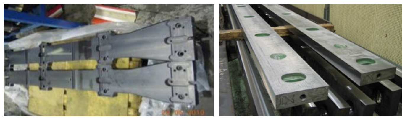
Fig 1. Toolox® 33 support beams

Toolox<sup>®</sup> is used in more and more steel plants around the world. At the SSAB Oxelösund plant, 100 tons of Toolox<sup>®</sup> are used per year for maintenance and in design of new equipment. In Fig 1, a part of a redesigned continuous casting machine can be seen. The support beams are made in Toolox<sup>®</sup> 33. To improve wear and corrosion resistance black nitriding is done.