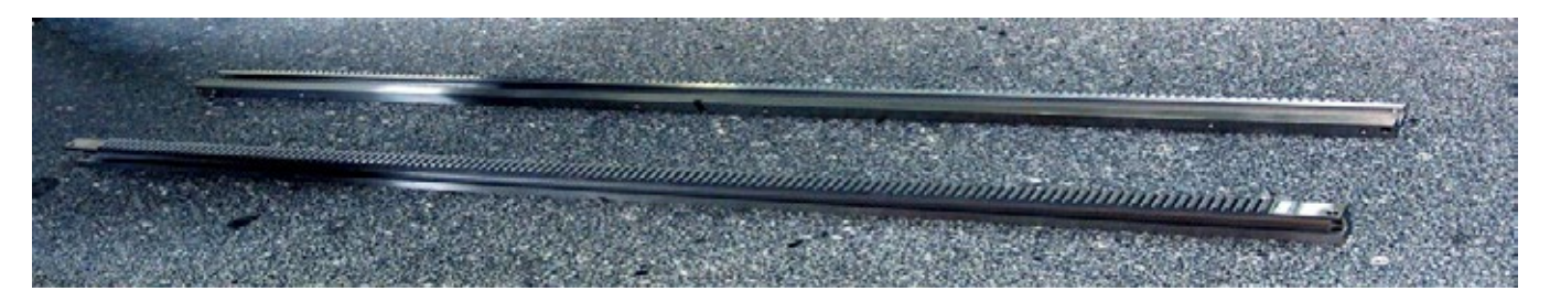
Fig 2. Toolox 33 precision machined gear rack

Toolox® has other excellent workshop properties. Being tempered at 590°C removes all residual stresses from the steel, making it possible to obtain remarkable precision when machining. An example is shown in Fig 2. The rack was obtained with only 0.004 mm sidewise deflection and 0.136 mm longitudinal deflection on 1.8 m measuring length. Starting by plate material instead of the previous round bar also gave large productivity benefits.