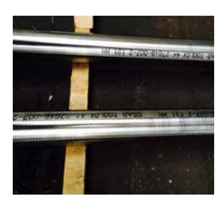
Toolox bar id.

Toolox is made in Sweden by SSAB, which for more than 40 years has been the market leader in high strength quenched and tempered plates, such as