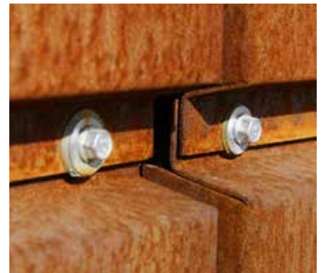
A ventilation gap is required behind a cassette