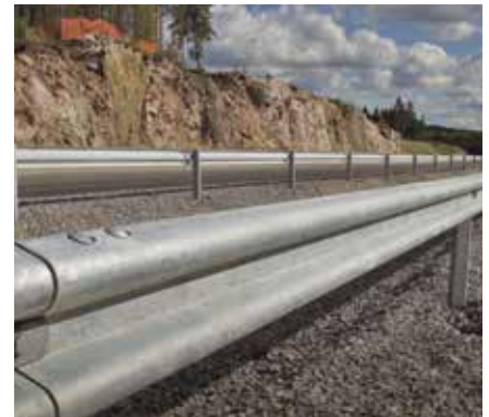
Weathering steel should not be used in salt-rich environments such as roads where de-icing salt is used.

Always ensure there is sufficient airflow around the steel and that water and moisture can escape from all the surfaces including the back of the plate.