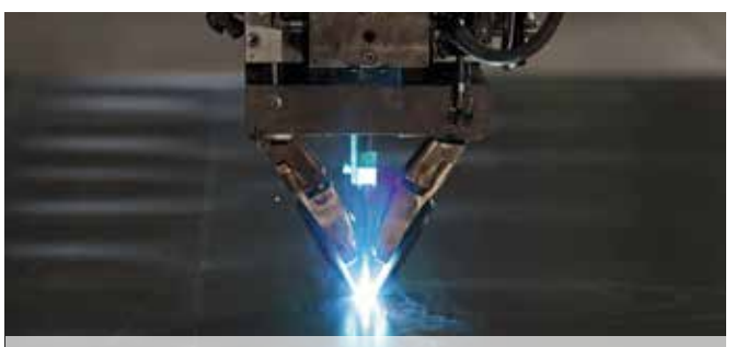
LASER WELDING Max length 20,000 mm. Max thickness 8 mm.