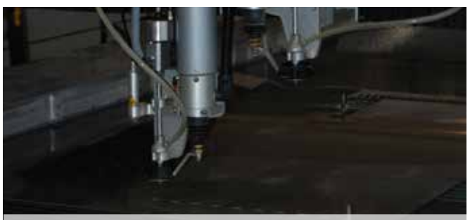
WATER JET CUTTING Max thickness 200 mm. Max length 8,000 mm.