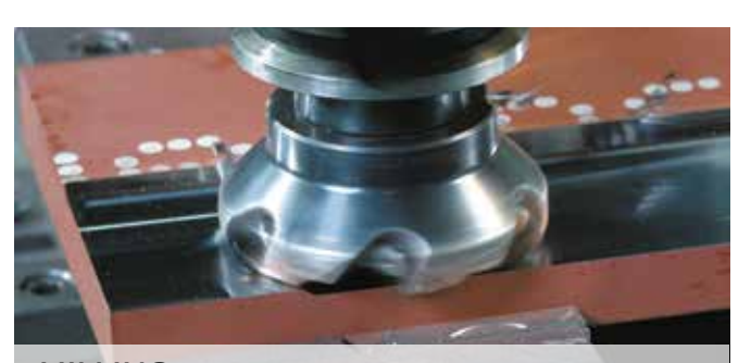
MILLING Max diameter 360 mm. Depth 8 mm.