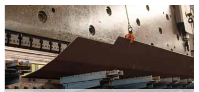
BENDING/PRESS BREAKING Max ton 4,000. Max working length 21,000 mm.