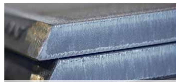
BEVELLING Max thickness 140 mm. Max length of bevel 12,000 mm.